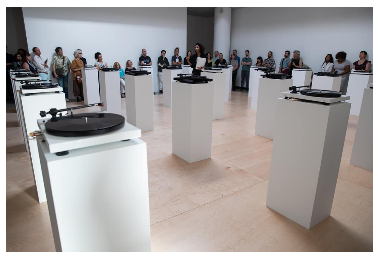
The central sound installation of American Monument that was on display at the University Art Museum in Long Beach, Sunday, September 16, 2018.

The artwork scrutinizes the cultural circumstances under which African Americans have lost their lives to police violence through the careful reading and interpretation of information, including use-of-force reports, prosecutor reports, witness testimonies, 911 calls and body and dash cam videos, procured from an ongoing Freedom of Information Act request process initiated in 2018 that found "police use of white dominant cultural constructions and stereotypes of 'Blackness,' mined from pop culture" were used to justify fatal violence, according to the release.